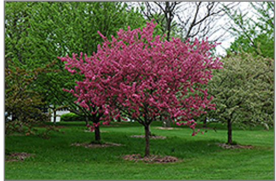
Prairifire Flowering Crab in bloom

This tree will require occasional maintenance and upkeep, and is best pruned in late winter once the threat of extreme cold has passed. It has no significant negative characteristics.