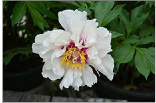
Cora Louise Peony flowers