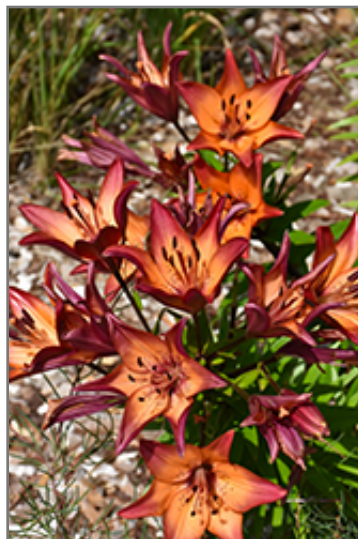
Royal Sunset Lily flowers