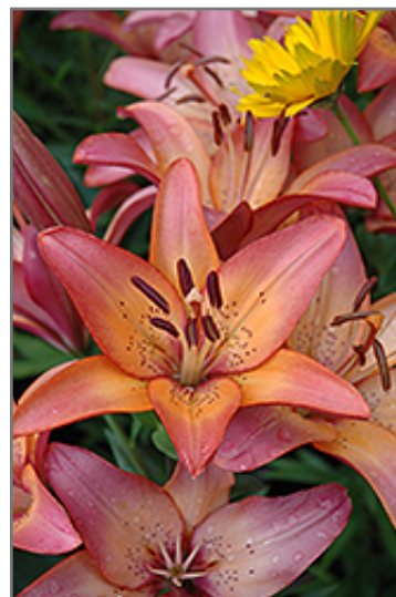
Royal Sunset Lily flowers