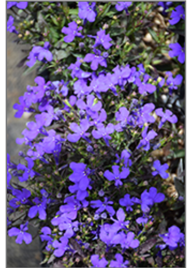
Crystal Palace Lobelia flowers

Crystal Palace Lobelia is recommended for the following landscape applications;