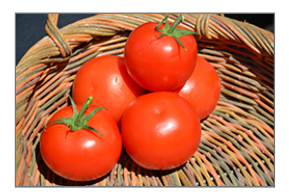
Celebrity Tomato fruit

Celebrity Tomato will grow to be about 4 feet tall at maturity, with a spread of 24 inches. When planted in rows, individual plants should be spaced approximately 3 feet apart. Because of its vigorous growth habit, it may require staking or supplemental support. This fast-growing vegetable plant is an annual, which means that it will grow for one season in your garden and then die after producing a crop.