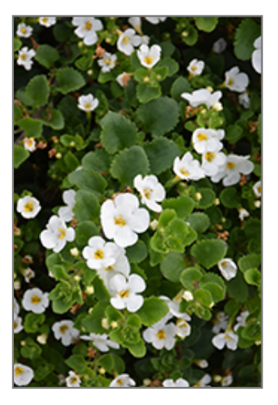
Scopia Gulliver White Bacopa flowers