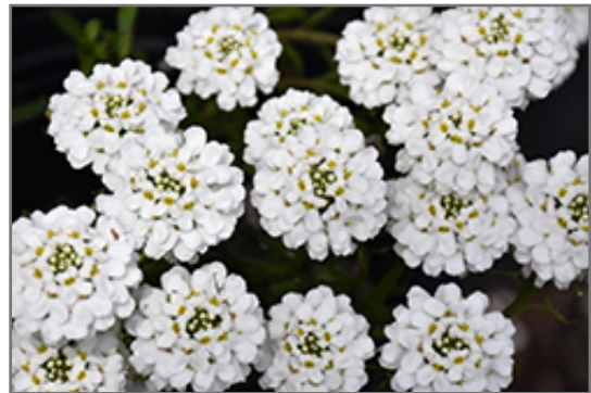
Snowsurfer Forte Candytuft flowers