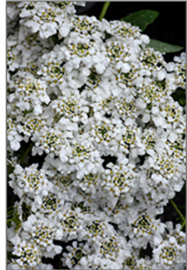
Snowsurfer Forte Candytuft flowers

Snowsurfer Forte Candytuft is recommended for the following landscape applications;