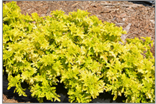
Under The Sea Yellowfin Tuna Coleus

Under The Sea Yellowfin Tuna Coleus will grow to be about 20 inches tall at maturity, with a spread of 24 inches. When grown in masses or used as a bedding plant, individual plants should be spaced approximately 20 inches apart. Although it's not a true annual, this fast-growing plant can be expected to behave as an annual in our climate if left outdoors over the winter, usually needing replacement the following year. As such, gardeners should take into consideration that it will perform differently than it would in its native habitat.