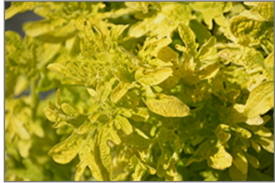
Under The Sea Yellowfin Tuna Coleus foliage

Under The Sea Yellowfin Tuna Coleus is recommended for the following landscape applications;