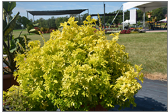
Under The Sea Yellowfin Tuna Coleus