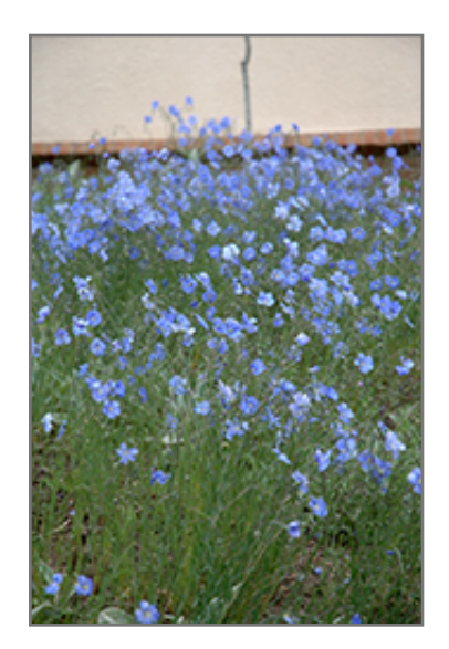
Blue Sapphire Perennial Flax in bloom