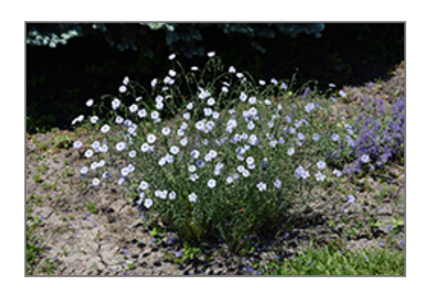
Blue Sapphire Perennial Flax in bloom

Blue Sapphire Perennial Flax is recommended for the following landscape applications;