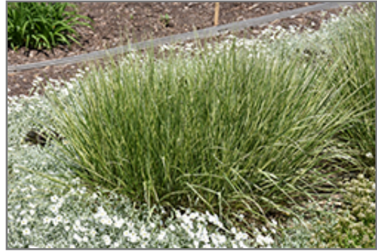
Variegated Reed Grass

Variegated Reed Grass will grow to be about 3 feet tall at maturity extending to 4 feet tall with the flowers, with a spread of 24 inches. It tends to be leggy, with a typical clearance of 1 foot from the ground, and should be underplanted with lower-growing perennials. It grows at a medium rate, and under ideal conditions can be expected to live for approximately 10 years. As an herbaceous perennial, this plant will usually die back to the crown each winter, and will regrow from the base each spring. Be careful not to disturb the crown in late winter when it may not be readily seen!