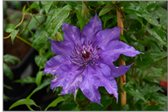
Edda Clematis flowers