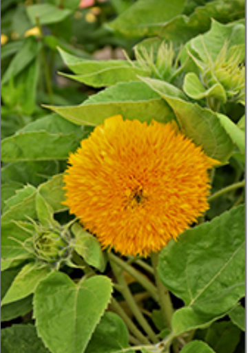
Teddy Bear Annual Sunflower flowers