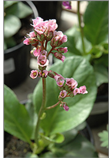
Red Beauty Bergenia flowers