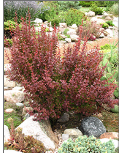
Orange Rocket Japanese Barberry

This shrub does best in full sun to partial shade. It is very adaptable to both dry and moist growing conditions, but will not tolerate any standing water. It is considered to be drought-tolerant, and thus makes an ideal choice for xeriscaping or the moisture-conserving landscape. It is not particular as to soil type or pH, and is able to handle environmental salt. It is highly tolerant of urban pollution and will even thrive in inner city environments. This is a selected variety of a species not originally from North America.