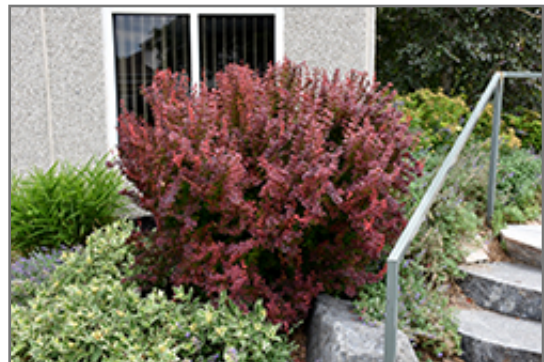
Orange Rocket Japanese Barberry