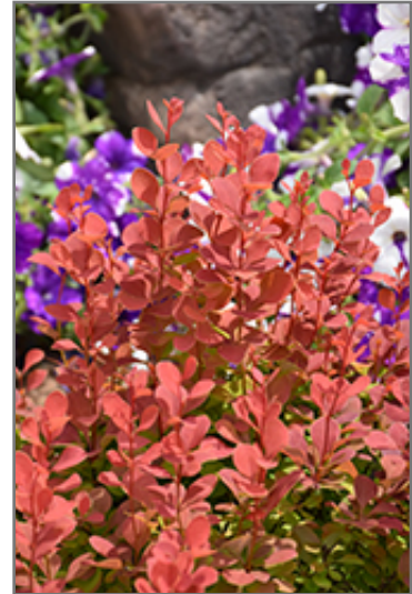
Orange Rocket Japanese Barberry foliage