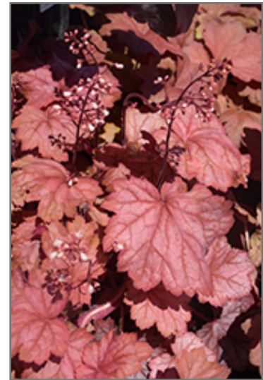
Georgia Peach Coral Bells in bloom