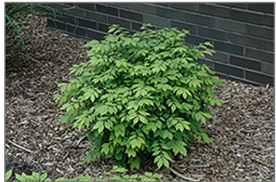
Little Moses Burning Bush