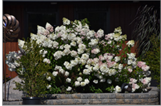
Vanilla Strawberry Hydrangea in bloom

This shrub performs well in both full sun and full shade. It prefers to grow in average to moist conditions, and shouldn't be allowed to dry out. It is not particular as to soil type or pH. It is highly tolerant of urban pollution and will even thrive in inner city environments. Consider applying a thick mulch around the root zone in winter to protect it in exposed locations or colder microclimates. This is a selected variety of a species not originally from North America.