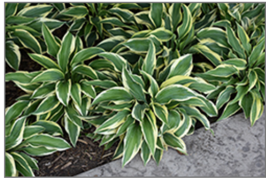
Wolverine Hosta