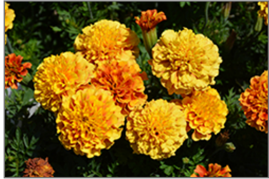
Strawberry Blonde Marigold flowers