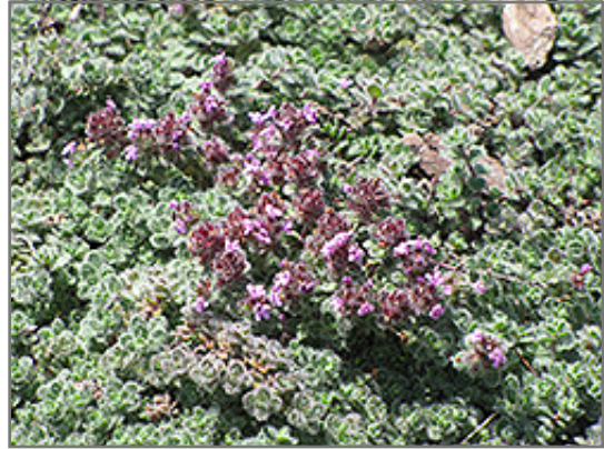
Wooly Thyme flowers