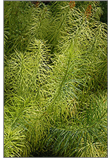
Narrow-Leaf Blue Star foliage

This plant does best in full sun to partial shade. It prefers to grow in average to moist conditions, and shouldn't be allowed to dry out. It is not particular as to soil pH, but grows best in rich soils. It is quite intolerant of urban pollution, therefore inner city or urban streetside plantings are best avoided. Consider applying a thick mulch around the root zone over the growing season to conserve soil moisture. This species is native to parts of North America. It can be propagated by cuttings.