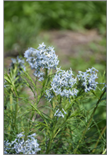
Narrow-Leaf Blue Star flowers