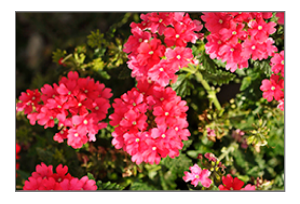
Estrella Lobsterfest Verbena flowers