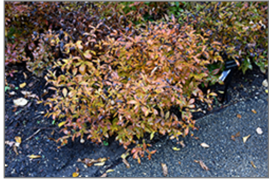
Bowman's Root in fall

Bowman's Root will grow to be about 30 inches tall at maturity, with a spread of 24 inches. Its foliage tends to remain dense right to the ground, not requiring facer plants in front. It grows at a medium rate, and under ideal conditions can be expected to live for approximately 10 years. As an herbaceous perennial, this plant will usually die back to the crown each winter, and will regrow from the base each spring. Be careful not to disturb the crown in late winter when it may not be readily seen!