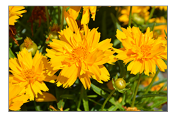
Double the Sun Tickseed flowers

Main Sheridan Location 505 College Meadow Dr. Sheridan, WY 82801