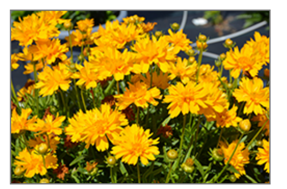
Double the Sun Tickseed in bloom