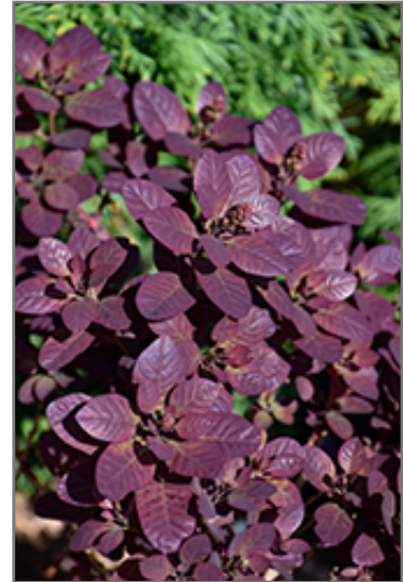
Velveteeny Purple Smokebush foliage

Velveteeny Purple Smokebush makes a fine choice for the outdoor landscape, but it is also well-suited for use in outdoor pots and containers. With its upright habit of growth, it is best suited for use as a 'thriller' in the 'spiller-thriller-filler' container combination; plant it near the center of the pot, surrounded by smaller plants and those that spill over the edges. It is even sizeable enough that it can be grown alone in a suitable container. Note that when grown in a container, it may not perform exactly as indicated on the tag - this is to be expected. Also note that when growing plants in outdoor containers and baskets, they may require more frequent waterings than they would in the yard or garden. Be aware that in our climate, most plants cannot be expected to survive the winter if left in containers outdoors, and this plant is no exception. Contact our experts for more information on how to protect it over the winter months.