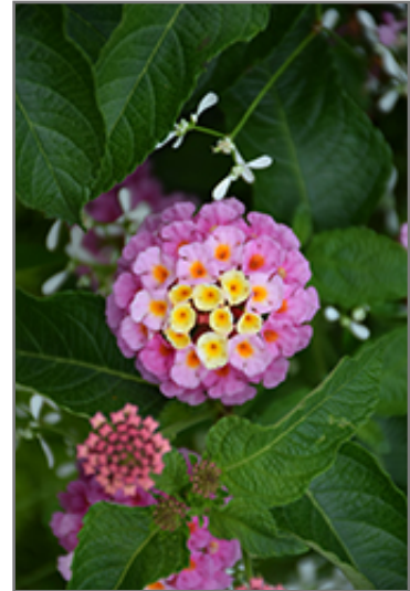
Luscious Pinkberry Blend Lantana flowers

Luscious Pinkberry Blend Lantana is a fine choice for the garden, but it is also a good selection for planting in outdoor containers and hanging baskets. It is often used as a 'filler' in the 'spiller-thriller-filler' container combination, providing a mass of flowers against which the thriller plants stand out. Note that when growing plants in outdoor containers and baskets, they may require more frequent waterings than they would in the yard or garden.