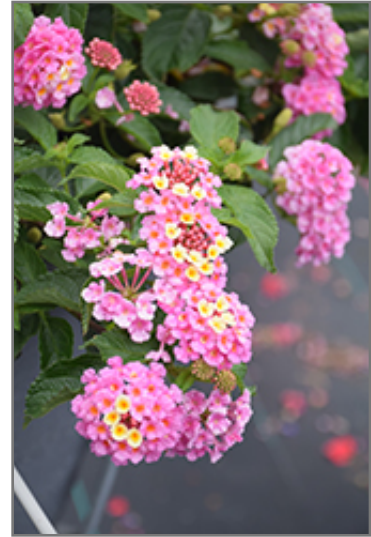
Luscious Pinkberry Blend Lantana flowers