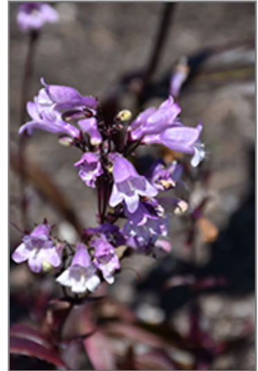
Blackbeard Beard Tongue flowers

Blackbeard Beard Tongue is recommended for the following landscape applications;