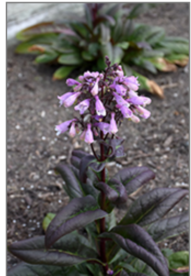
Blackbeard Beard Tongue in bloom