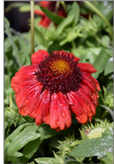
Mesa Red Blanket Flower flowers

Mesa Red Blanket Flower is recommended for the following landscape applications;