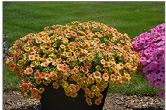
Supertunia Honey Petunia in bloom