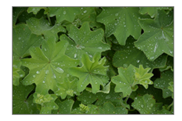
Lady's Mantle foliage

Lady's Mantle will grow to be about 18 inches tall at maturity, with a spread of 18 inches. Its foliage tends to remain dense right to the ground, not requiring facer plants in front. It grows at a medium rate, and under ideal conditions can be expected to live for approximately 10 years. As an herbaceous perennial, this plant will usually die back to the crown each winter, and will regrow from the base each spring. Be careful not to disturb the crown in late winter when it may not be readily seen!