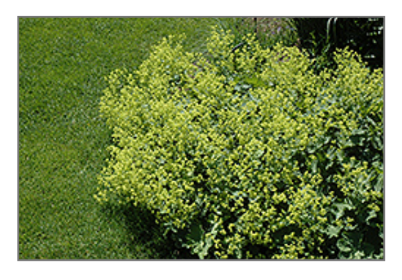
Lady's Mantle in bloom