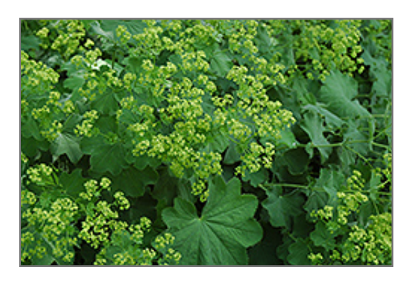
Lady's Mantle flowers

Lady's Mantle is recommended for the following landscape applications;