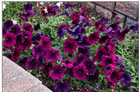
Easy Wave Burgundy Velour Petunia flowers