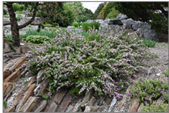
Purple Broom in bloom