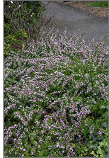
Purple Broom in bloom

This shrub should only be grown in full sunlight. It prefers dry to average moisture levels with very well-drained soil, and will often die in standing water. It is considered to be drought-tolerant, and thus makes an ideal choice for a low-water garden or xeriscape application. It is particular about its soil conditions, with a strong preference for clay, alkaline soils, and is able to handle environmental salt. It is highly tolerant of urban pollution and will even thrive in inner city environments. This species is not originally from North America.