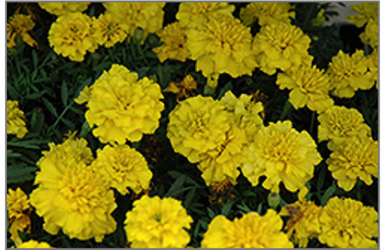
Boy Yellow Marigold flowers