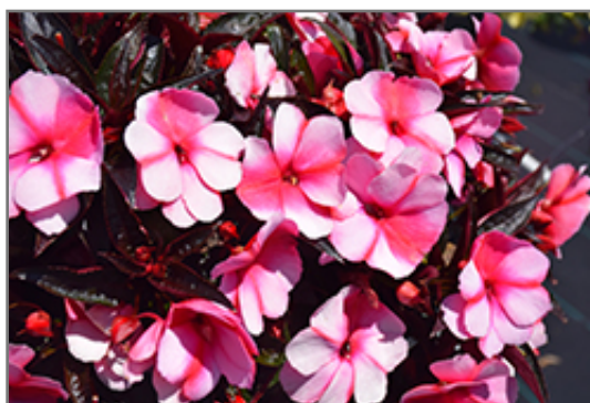
Super Sonic Sweet Cherry New Guinea Impatiens flowers