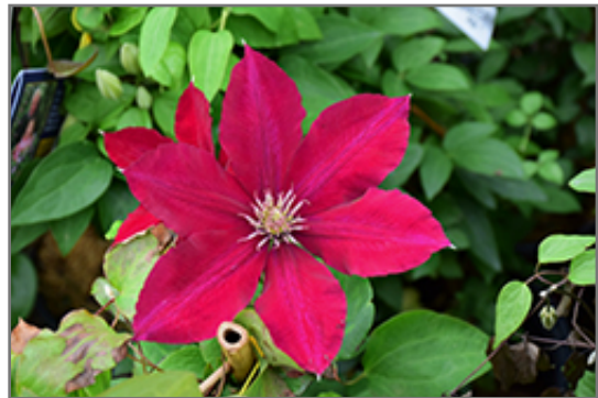
Rebecca Clematis flowers