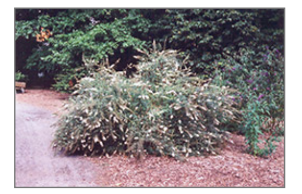
Butterfly Bush in bloom