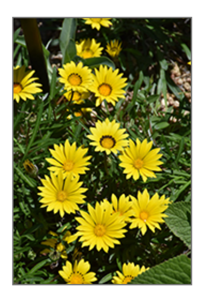
Colorado Gold Gazania flowers

Colorado Gold Gazania is recommended for the following landscape applications;