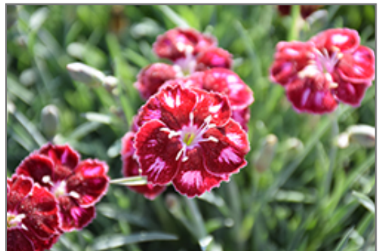
Mountain Frost Ruby Glitter Pinks flowers