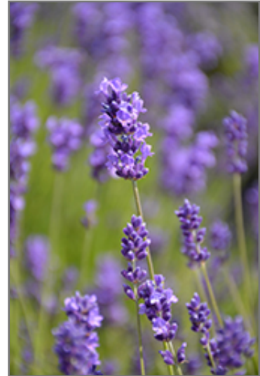
Imperial Gem Lavender flowers

Imperial Gem Lavender is recommended for the following landscape applications;