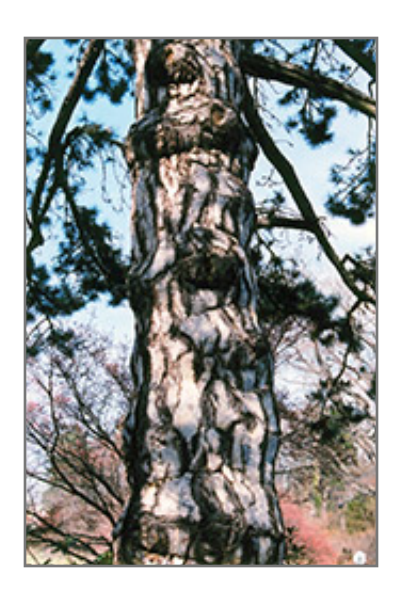
Austrian Pine bark