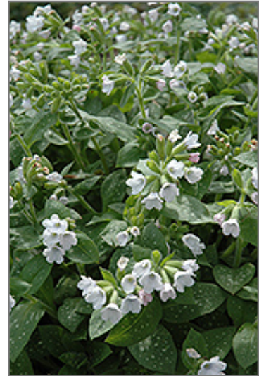
Sissinghurst White Lungwort flowers