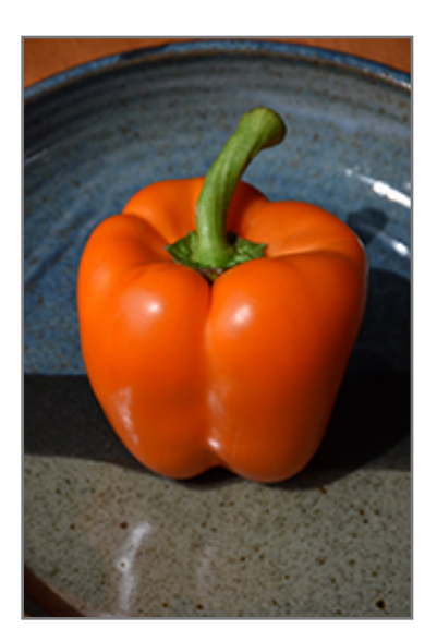
Orange Bell Pepper fruit