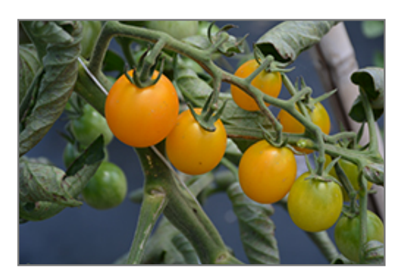
SunSugar Tomato fruit

SunSugar Tomato will grow to be about 6 feet tall at maturity, with a spread of 24 inches. When planted in rows, individual plants should be spaced approximately 3 feet apart. Because of its vigorous growth habit, it may require staking or supplemental support. This fast-growing vegetable plant is an annual, which means that it will grow for one season in your garden and then die after producing a crop.