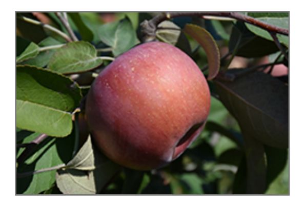
SnowSweet Apple fruit