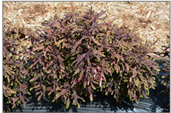
Under The Sea Lion Fish Coleus