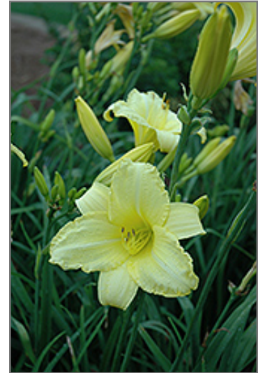
Happy Ever Appster Happy Returns Daylily flowers

Happy Ever Appster Happy Returns Daylily is recommended for the following landscape applications;