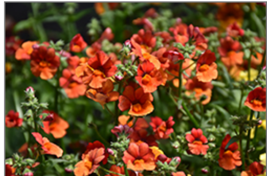
Sunsatia Blood Orange Nemesia flowers