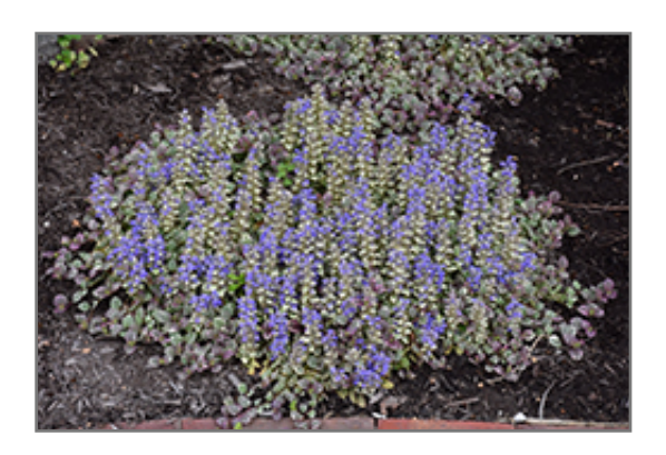
Burgundy Glow Bugleweed in bloom