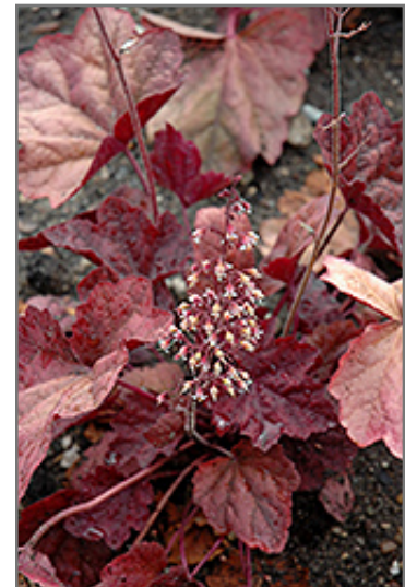
Lava Lamp Coral Bells flowers