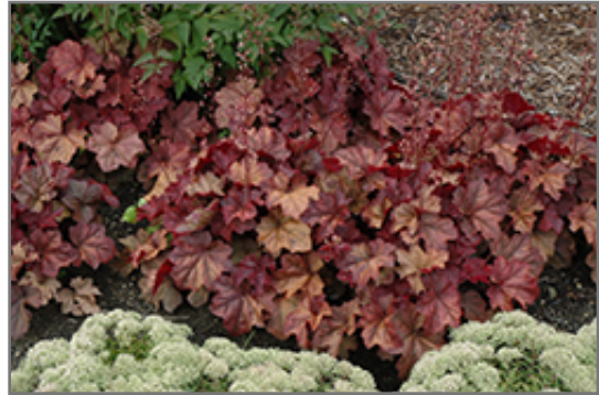
Lava Lamp Coral Bells

Lava Lamp Coral Bells is a fine choice for the garden, but it is also a good selection for planting in outdoor pots and containers. With its upright habit of growth, it is best suited for use as a 'thriller' in the 'spiller-thriller-filler' container combination; plant it near the center of the pot, surrounded by smaller plants and those that spill over the edges. Note that when growing plants in outdoor containers and baskets, they may require more frequent waterings than they would in the yard or garden. Be aware that in our climate, most plants cannot be expected to survive the winter if left in containers outdoors, and this plant is no exception. Contact our experts for more information on how to protect it over the winter months.