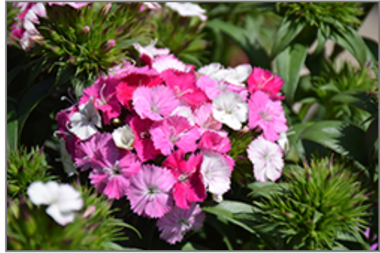
Amazon Rose Magic Pinks flowers

Amazon Rose Magic Pinks is recommended for the following landscape applications;